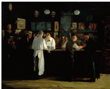
John Sloan, McSorley's Bar , 1912. Oil on canvas, 26 x 32 in. Detroit Institute of Arts, Founders Society Purchase

More than 70 paintings by Ashcan School painters Robert Henri, George Bellows, William Glackens and John Sloan will be on view at the New-York Historical Society starting Nov 28. Organized by the Detroit Institute of Arts, the showing focuses on these artists' shared fascination with pastimes and the forms of recreation city dwellers managed to pursue in their precious leisure time around the turn of the century.